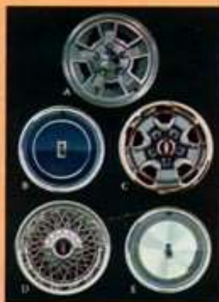
Pick from five available wheel covers and wheels, including (A) special cast aluminum wheel, (B) wheel cover with matching body color, (C) Super-Stock wheel with matching body color, (D) simulated wire wheel disc and (E) deluxe wheel disc.