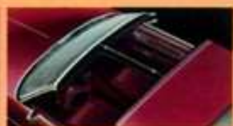
T-roof with lift-out panels adds distinction, available on coupes.