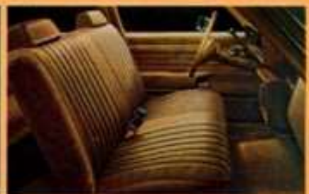
Cutlass Cruiser interior in supple, durable vinyl.