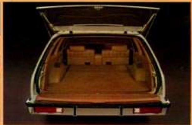
Up to 71.8 cu. ft. of load space in each wagon. Functional split tailgate, too.