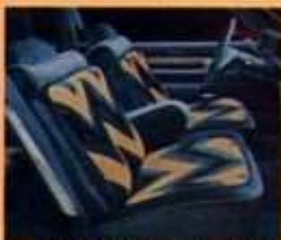
For special distinction, a new "Renaissance" interior trim, available exclusively on Cutlass Supreme Brougham models. Features complementary shades of blue and camel in a bold, contemporary pattern of rich velvet.