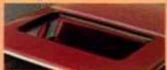
Sunroof available (reduces headroom).

Availability of optional equipment varies by model. Check your dealer for details.