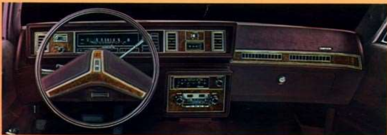
Cutlass watching is great from this view, too. All controls within easy reach.