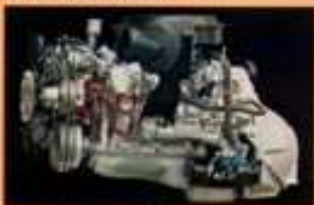
An engine for the 80's. The available 5.3-liter diesel V8. Smooth and responsive.