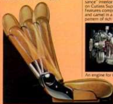
Reclining front bucket seats are standard on Calais, available on other Cutlass models.