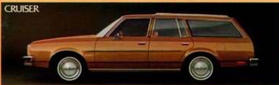
Cutlass Cruiser: The budget-pleasing Olds wagon.