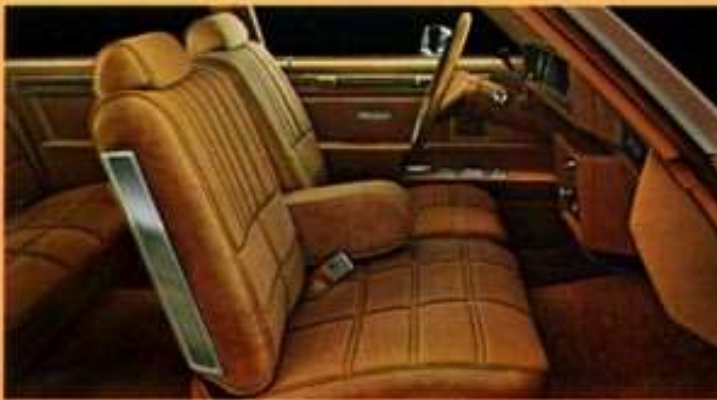
Brougham Cruiser's available divided front seat in elegant brushed nylon knit.