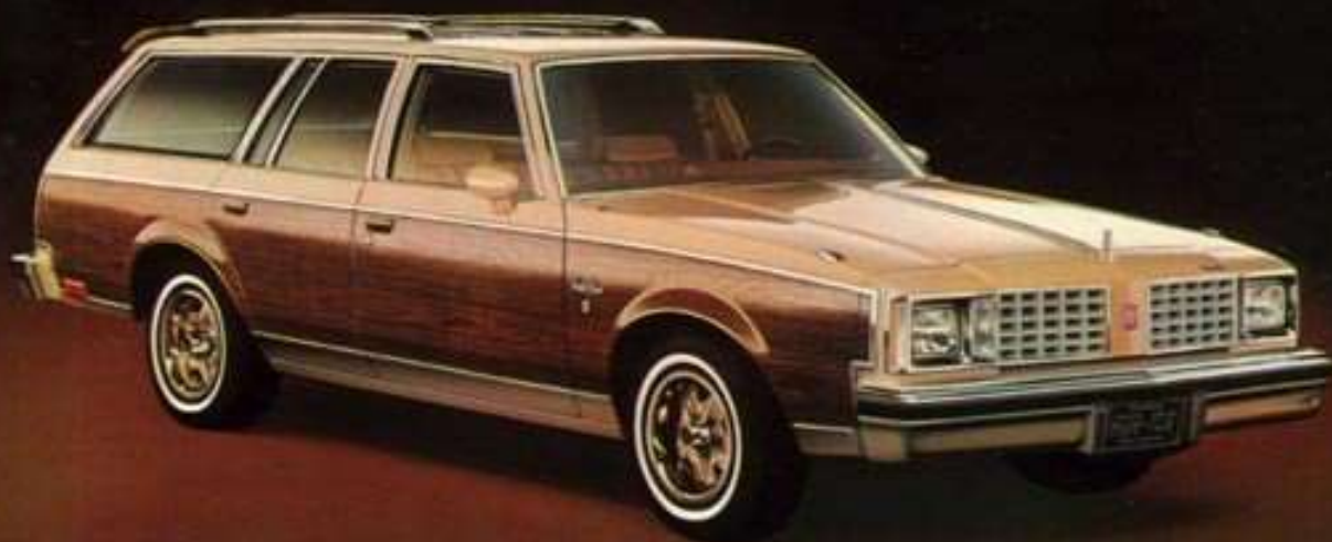
Cutlass Cruiser Brougham: The luxurious way to go Olds. Wood-grain vinyl paneling is available.