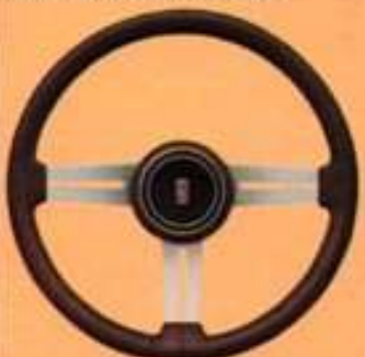
Available custom sport wheel with padded grip. Standard on Calais.