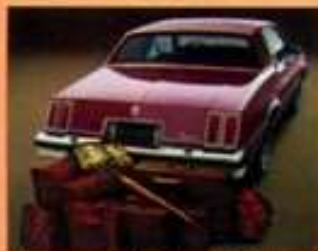
All that luggage? Cutlass can handle it with 16.1 cu. ft. of trunk space.